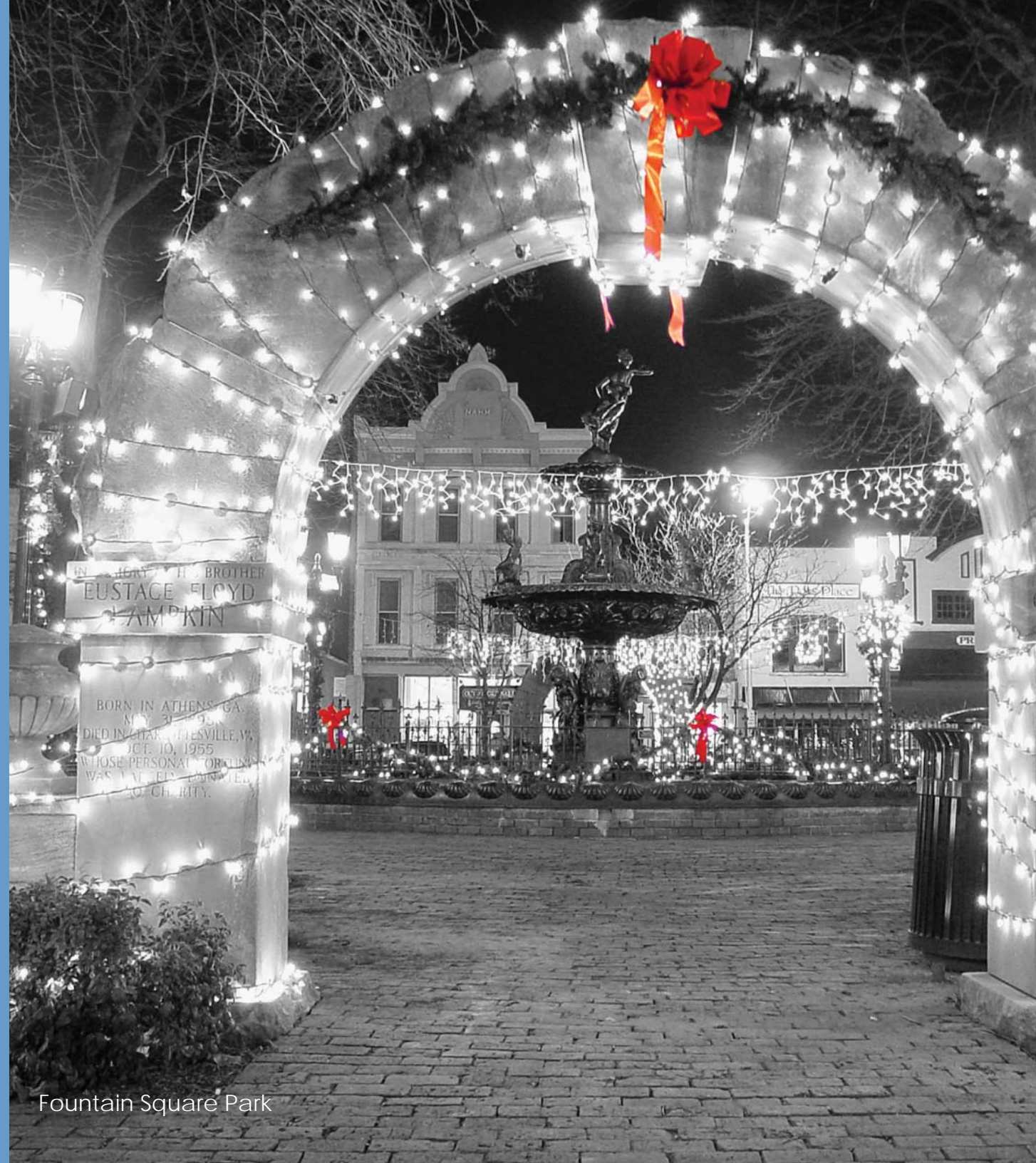
Fountain Square Park

505 Other Permits Issued 162 New Vendors 446 Bikes Registered On-line $64,900 Received in Donations 1,570 Fleet Work Orders Completed (Repairs) 1,354 Citations Issued for Speeding 52 City Appointees to Various Boards, Commissions and Agencies 23 Applications & Inquiries Regarding the Use of the Downtown Parks 1,545 Linear Miles of Streets Maintained/ Cleaned 673 Citations Issued for Running Red Lights