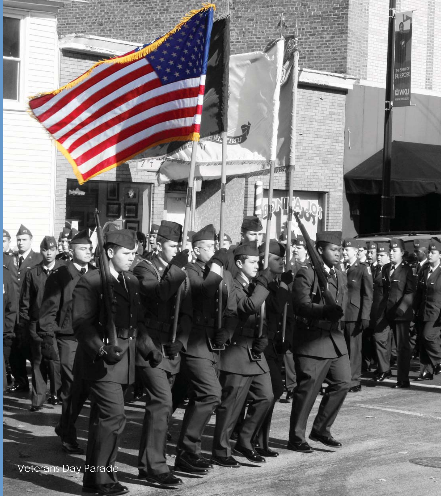
Veterans Day Parade

61 eNews Releases Distributed 1,006 Hours of Safety Related Instruction Presented 9 Stormwater Presentations/Events $151,793,878 Value of Building Permits Issued 1,264 Fire Code Inspections Conducted 5,544 Accounts Payable Checks Issued 5,968 eNews Subscribers 31 Formal Bids Processed and Posted on Website