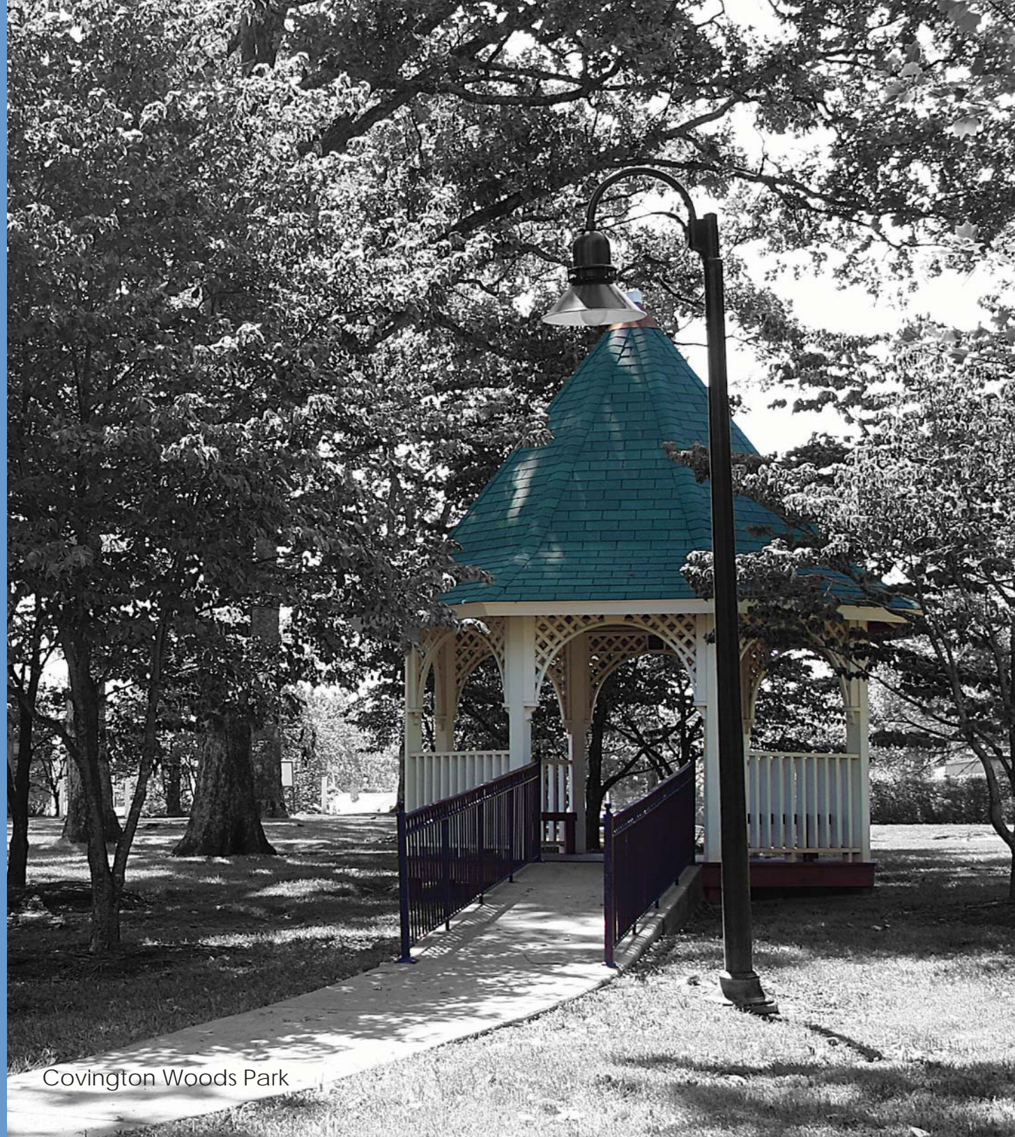
Covington Woods Park