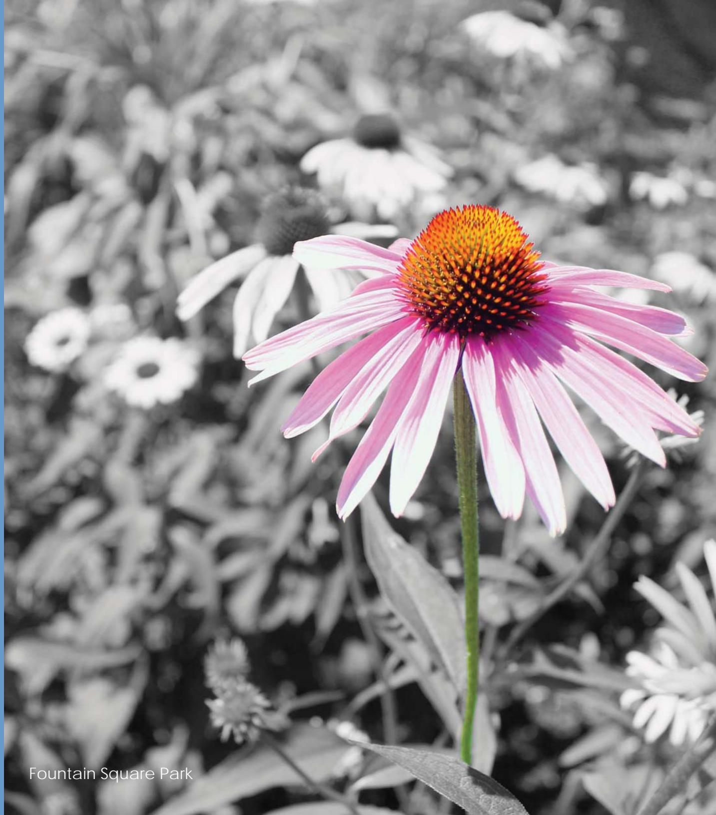
Fountain Square Park