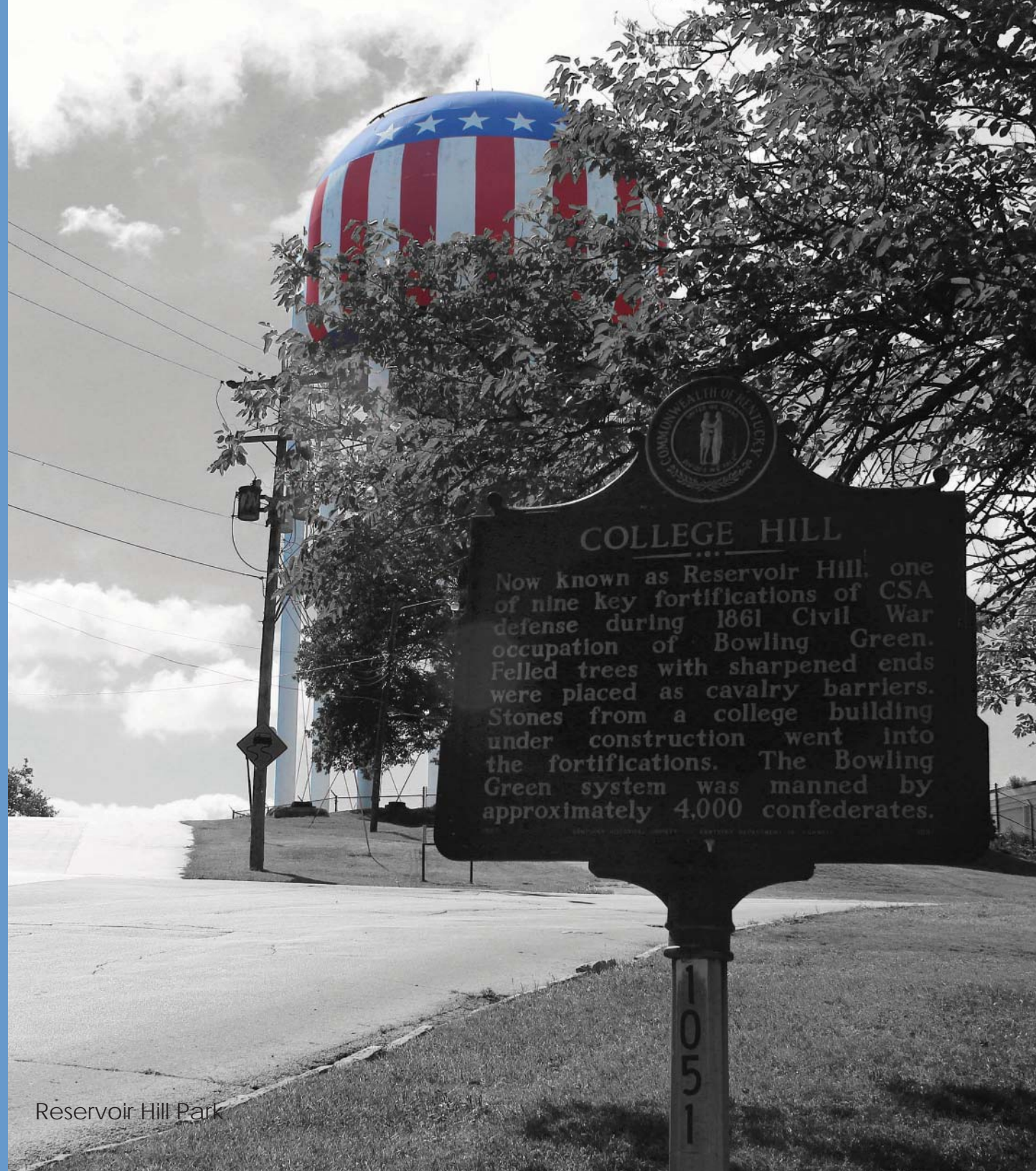
Reservoir Hill Park