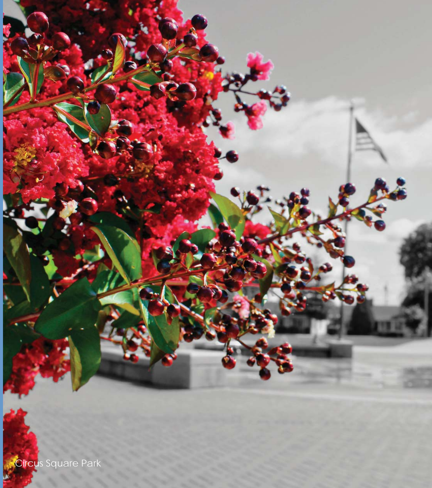
Circus Square Park