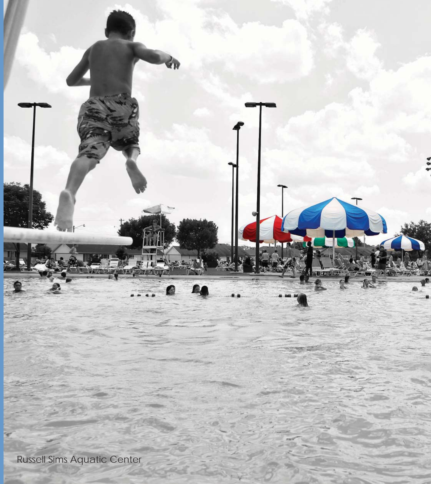
Russell Sims Aquatic Center