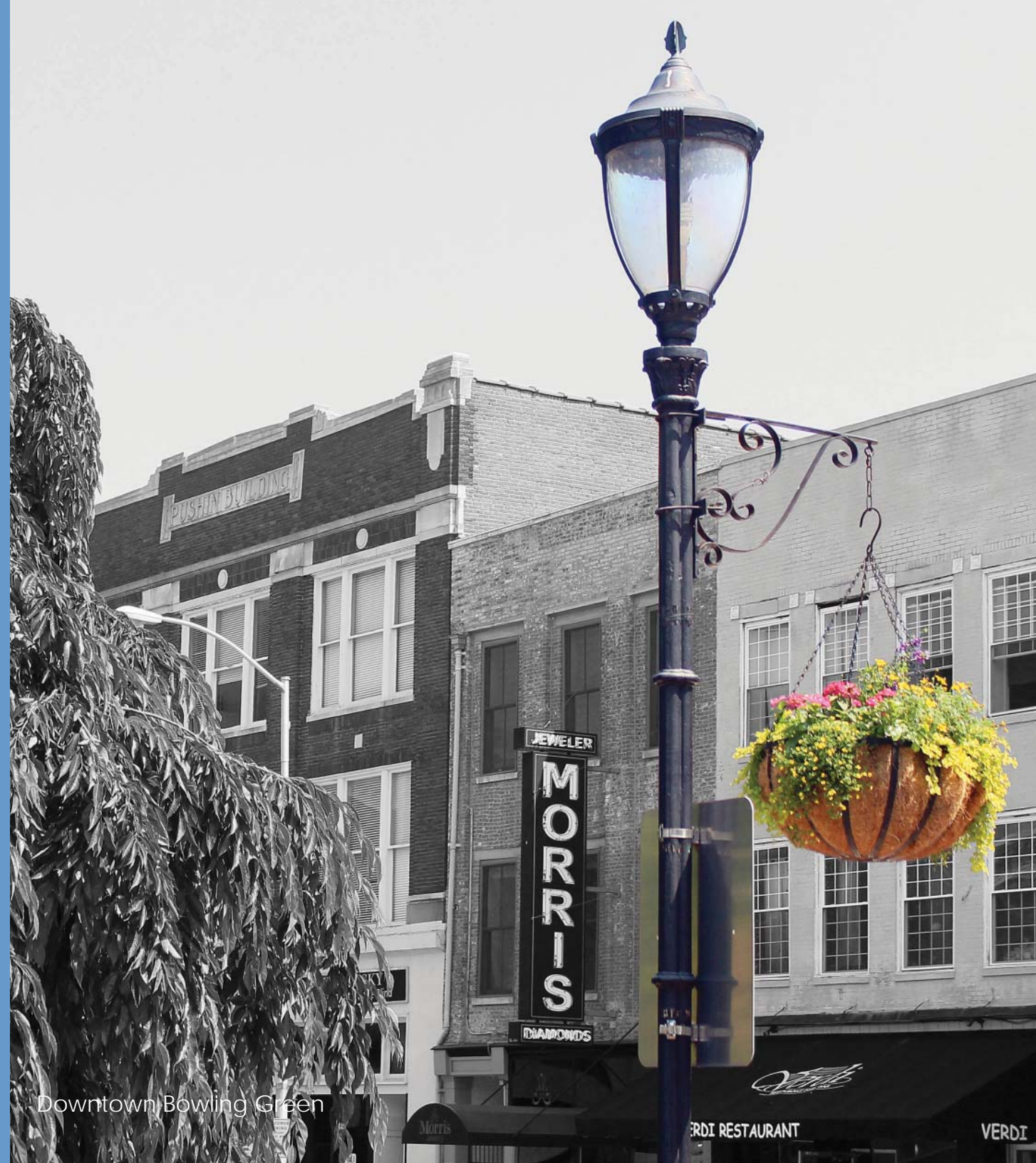
Downtown Bowling Green