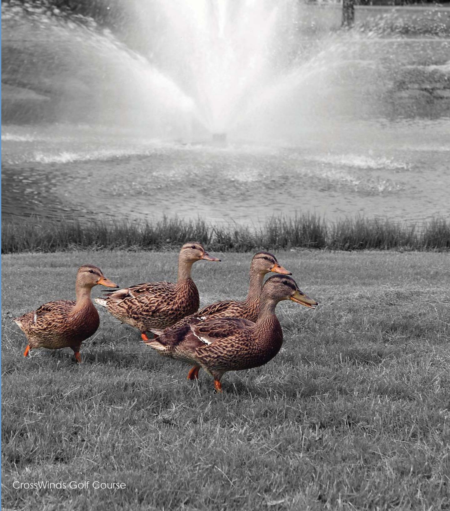
CrossWinds Golf Course