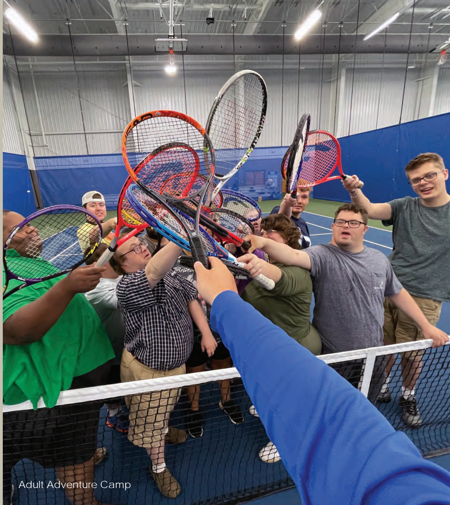
Adult Adventure Camp