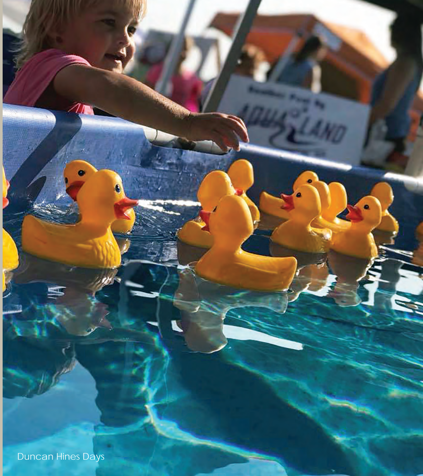
Duncan Hines Days