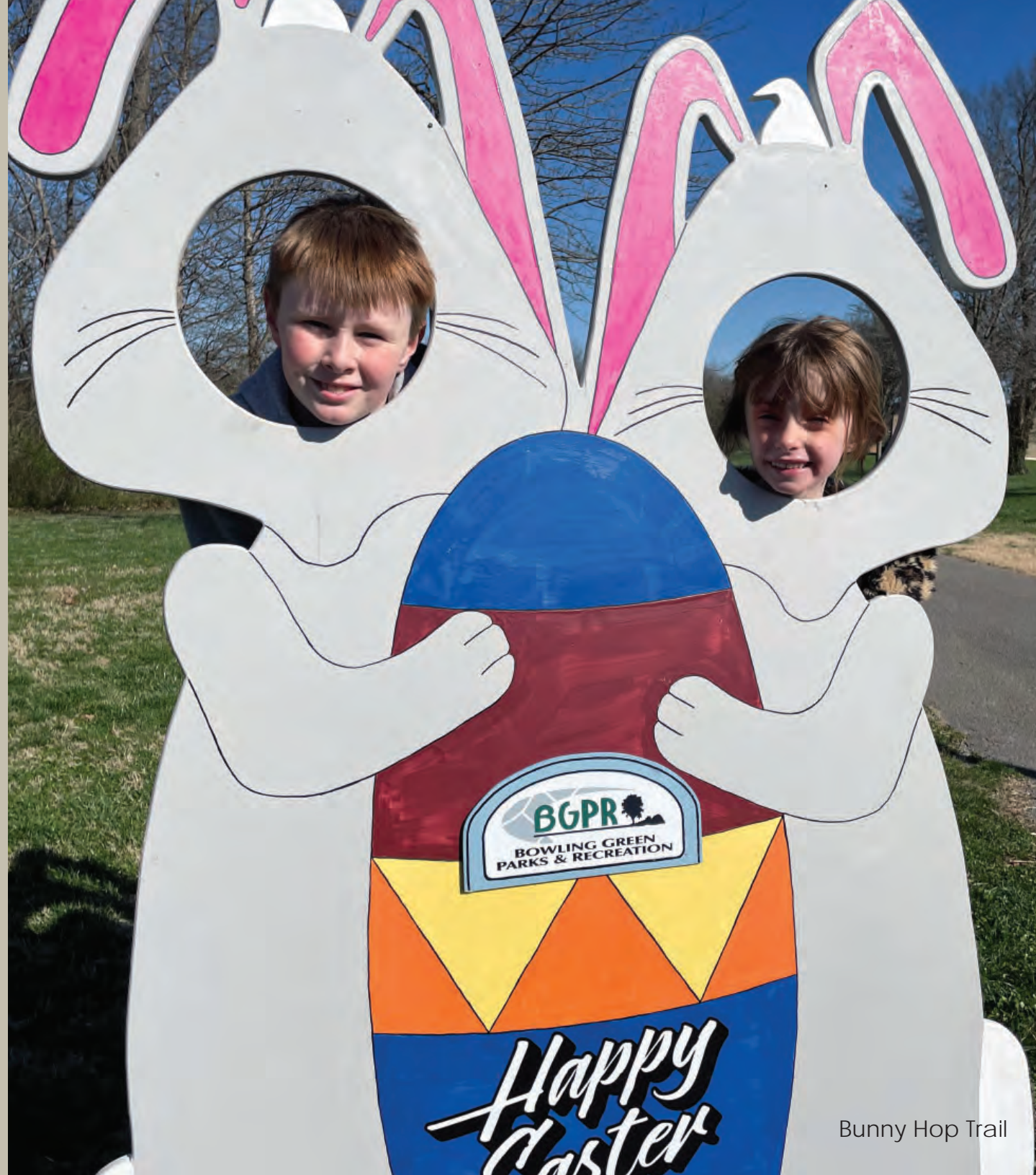
Bunny Hop Trail