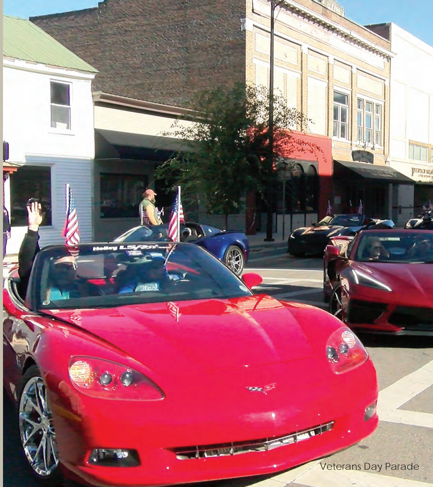
Veterans Day Parade

2,783 eNews Subscribers for Job Vacancy Announcements