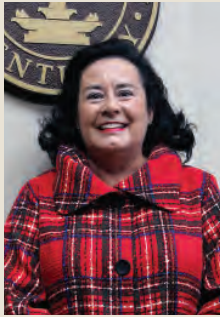
Commissioner Melinda Hill