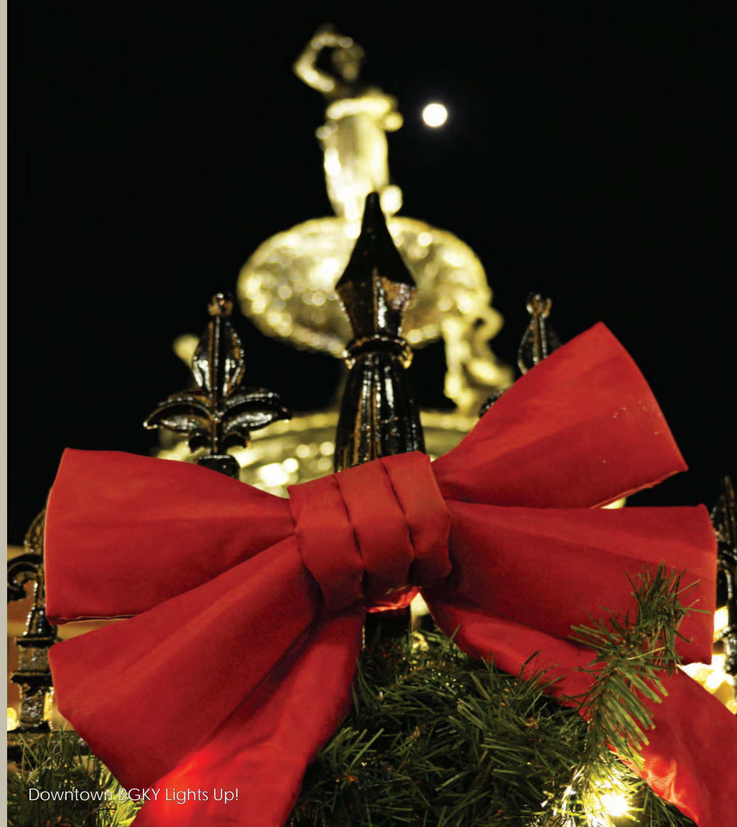
Downtown BGKY Lights Up!