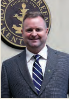
Mayor Todd Alcott