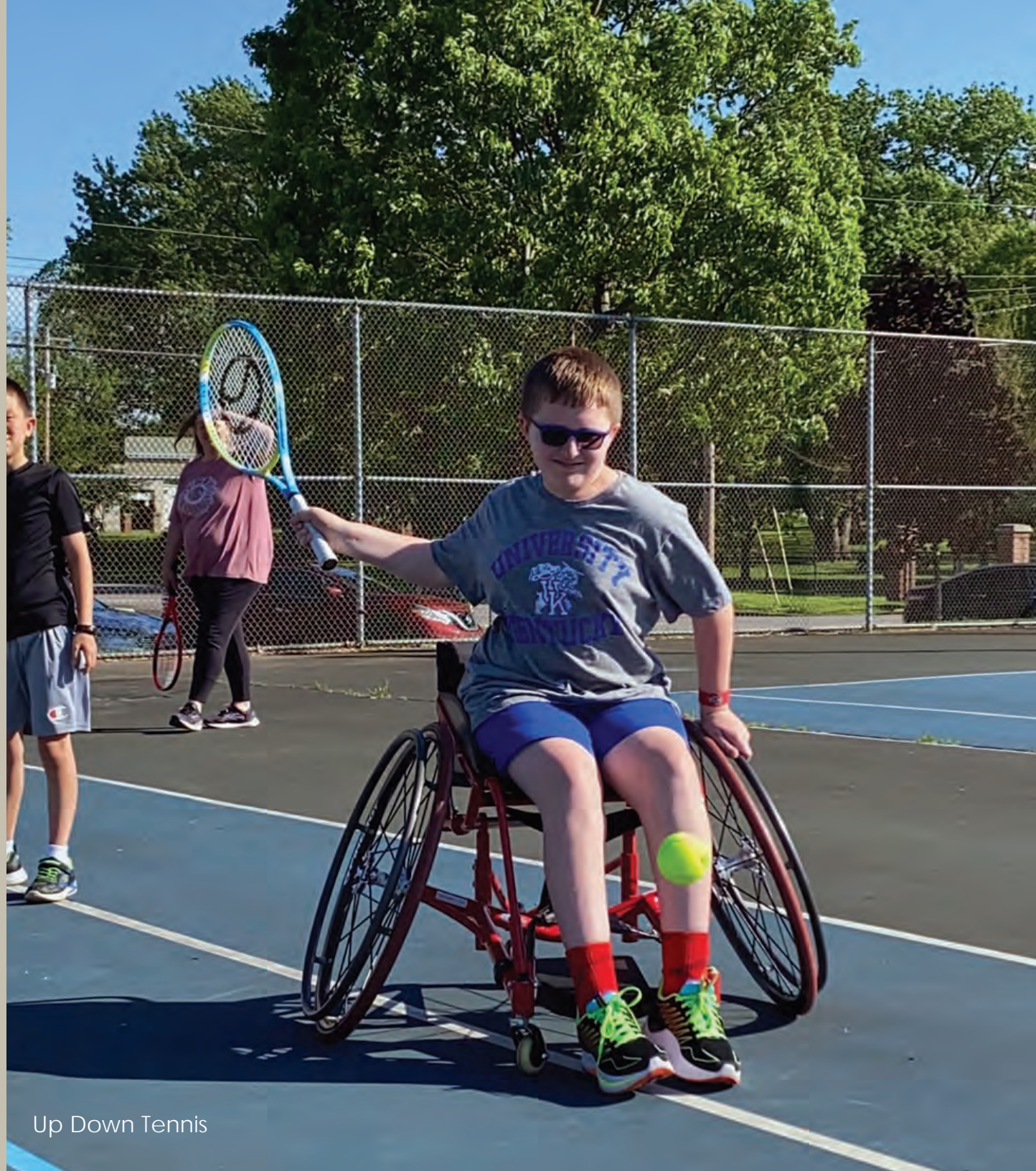
Up Down Tennis