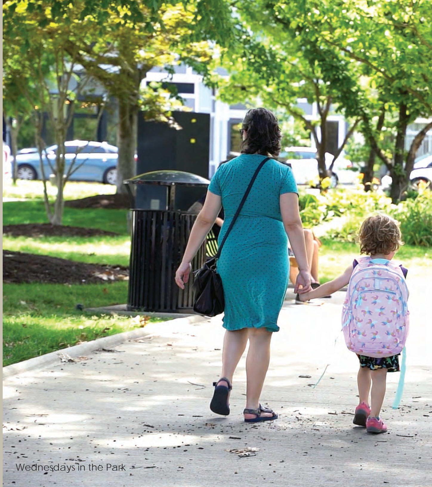
Wednesdays in the Park