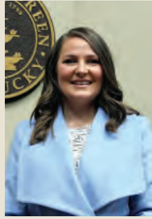
Commissioner Dana Beasley-Brown