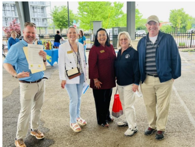
Mayor Todd Alcott